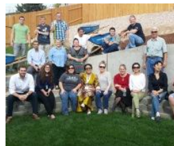
Meeting discusses inclusive mountain development

More than 400 scientists, researchers and practitioners from across the global came to Perth, Scotland on 4-8