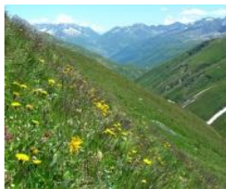
Mountain science community gathers in Perth

The Mountain Partnership Steering Committee met in Turin, at the Palazzo dal Pozzo della Cisterna, on 14-15 October 2015. This