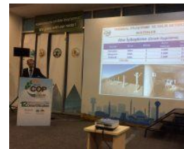
Partnerships key to achieving global goals

The Fourth International Women of the Mountains Conference (WOMC) was co-organized by Utah Valley University (UVU) and