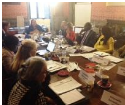
MP Steering Committee discusses 2016

The Mountain Partnership Steering Committee met in Turin, at the Palazzo dal Pozzo della Cisterna, on 14-15 October 2015. This